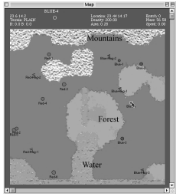
Figure 3: The Capture the Flag domain.

This type of planning, which uses stored solutions